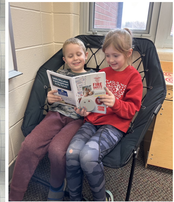
AHSTW students look through the new book.

We would like to thank these businesses for their support in funding the fire safety books that were distributed to AHSTW Community School kindergarten, 1st grade and 2nd grade students. Enough funding was donated to cover 171 students!